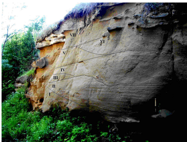
Fig. 2. Cross-bed series in sandstones of Tatarian Arch zone near Krasny Bor (far eastern part)

Granulometric characteristics of the deposits were researched for terrigenous layers of the west clay-carbonate part of the basin in the outcrops of Soroch'i Gory and Kamskie Polyany. As content of the terrigenous units in the sequence does not exceed 10-20 %, averaged granulometric characteristics of the deposits give too high value of the reconstructed paleohydrodynamic parameters.