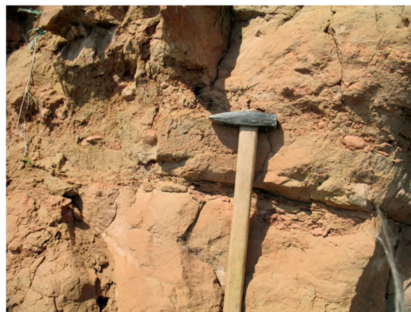
Fig. 3. Basal gravels above erosion surface in the sandstone zone of Tatarian Arch near Elabuga (eastern part)