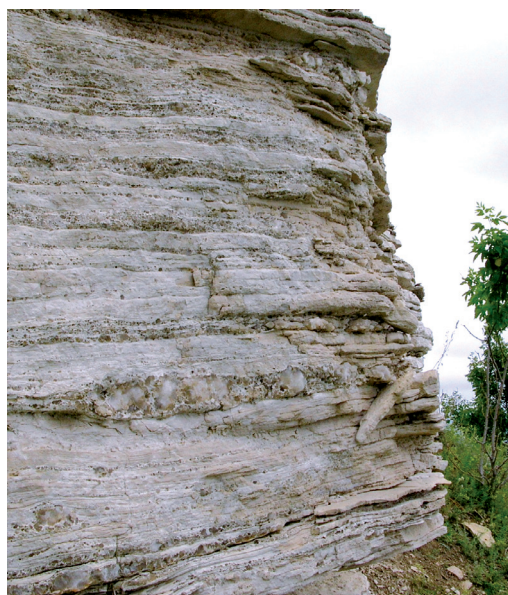
Fig. 5. Carbonate deposits with gypsum interlayers in the western part of the Western basin (Soroch'i Gory)