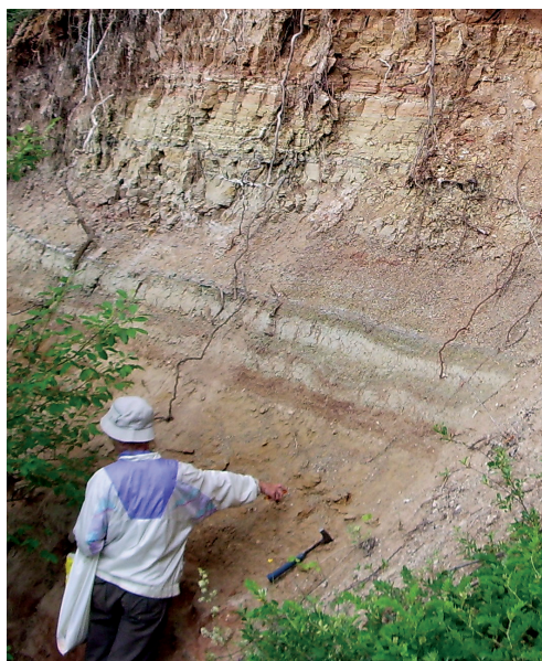
Fig. 4. Silt-clay sequence of the central part of Western basin (Kamskie Polyany)